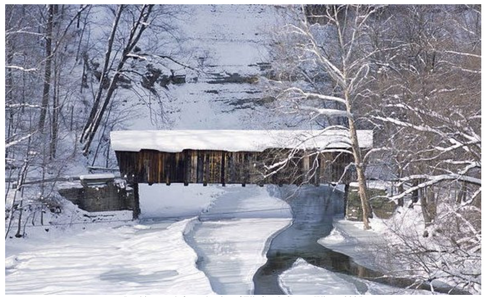
Looking north from the rim of Elk Creek Gorge, Winter 2005