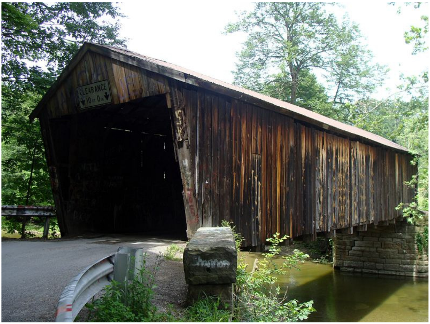
The "Northern" Approach – July 4, 2008.