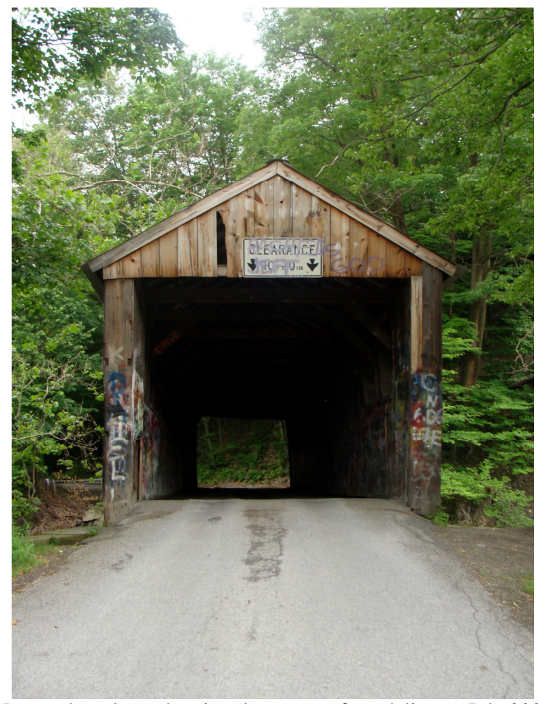
Yet another photo showing the extent of vandalism -- July 2008