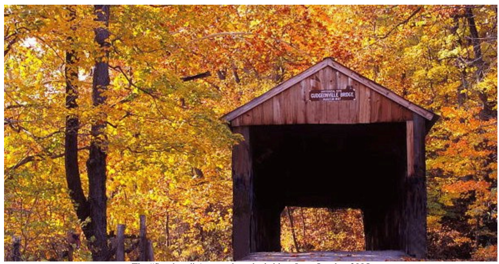
The "Southern" Approach to the bridge, Late October 2005